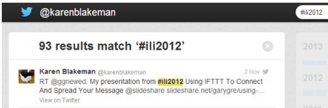
Figure 3: Search on #ili2012 in a downloaded Twitter archive

It is not clear, though, how often you are allowed to download your archive and there does not seem to be a top-up option.